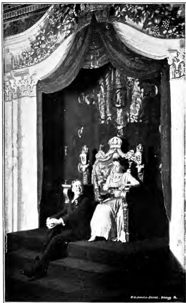
"GRAUSTARK WELCOMES THE AMERICAN PRINCE."