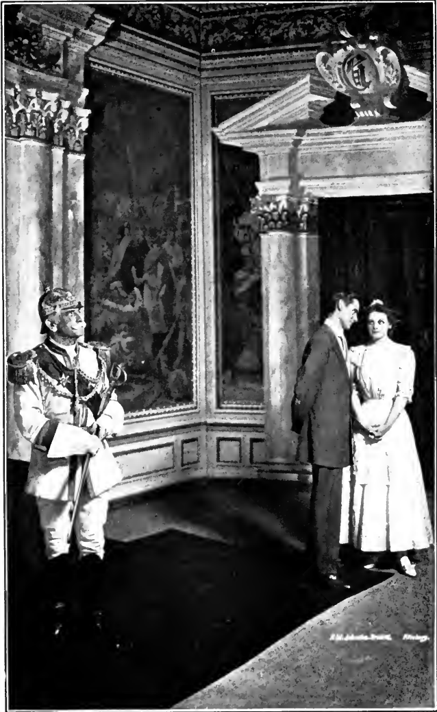
"TWO'S COMPANY, THREE'S A CROWD."