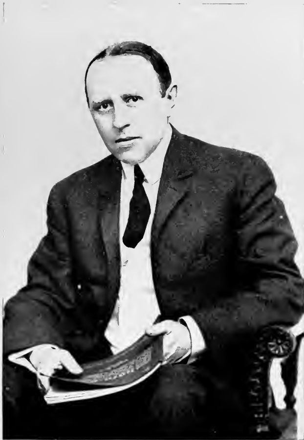
GEORGE BARR McCUTCHEON