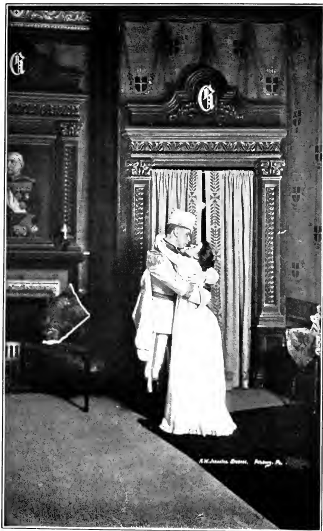
"GOOD BYE, MY AMERICAN."