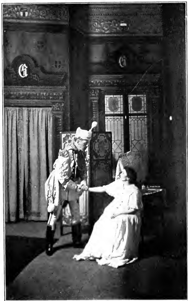
"I'M SORRY YOU ARE THE PRINCESS."