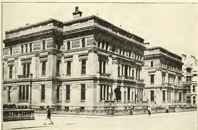
PALACES BUILT BY WILLIAM H. VANDERBILT, And Resided in by Him and His Descendants.