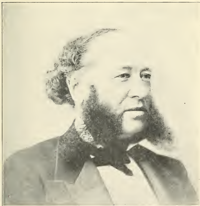
WILLIAM H. VANDERBILT, He Inherited the Bulk of His Father's Fortune and Doubled It.