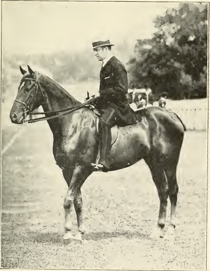
CORNELIUS VANDERBILT, Grandson of Commodore Vanderbilt.