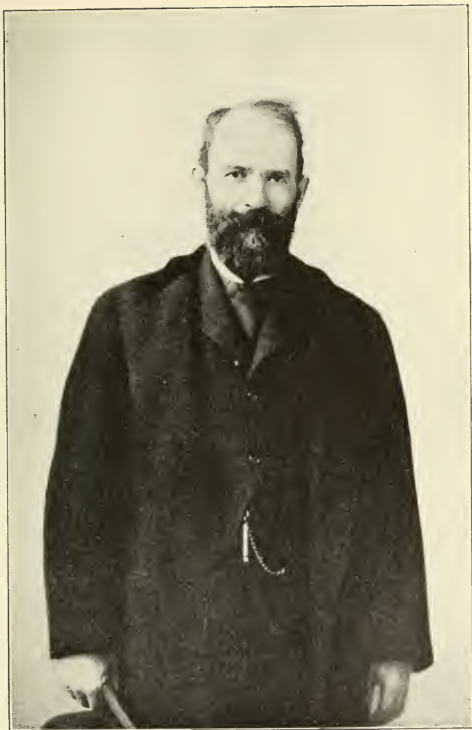
JAY GOULD, Who, in a Brief Period, Possessed Himself of a Vast Fortune.