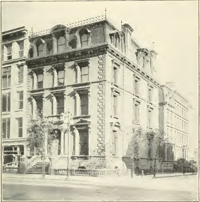
RESIDENCE OF JAY GOULD, 759 Fifth Avenue, New York.