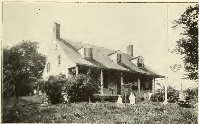
THE ORIGINAL VANDERBILT HOMESTEAD, Near New Dorp, Staten Island, N. Y.