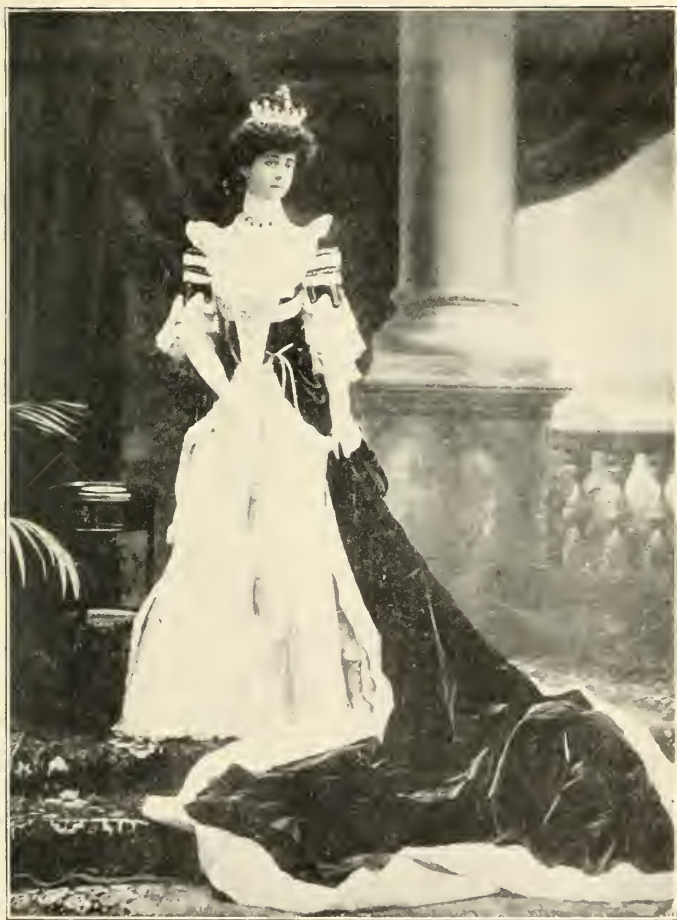
THE DUCHESS OF MARLBOROUGH, Daughter of William K. Vanderbilt.