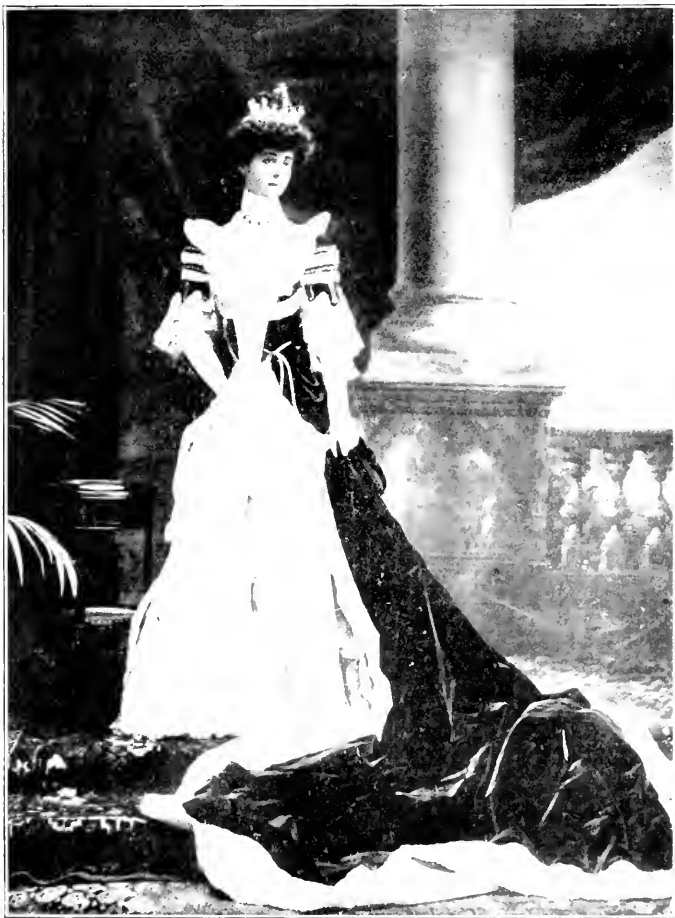
THE DUCHESS OF MARLBOROUGH, Daughter of William K. Vanderbilt.