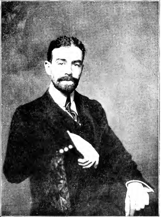
CORNELIUS VANDERBILT, Great-Grandson of Commodore Vanderbilt.