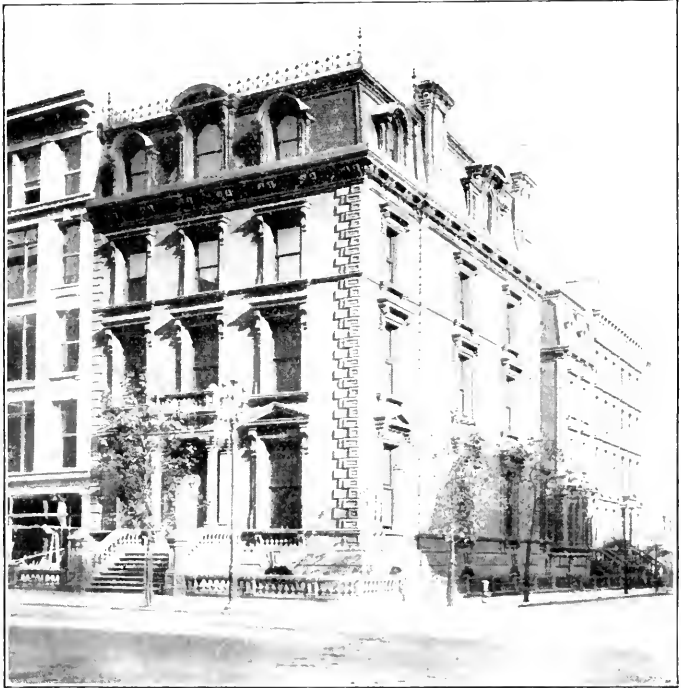
RESIDENCE OF JAY GOULD, 759 Fifth Avenue, New York.