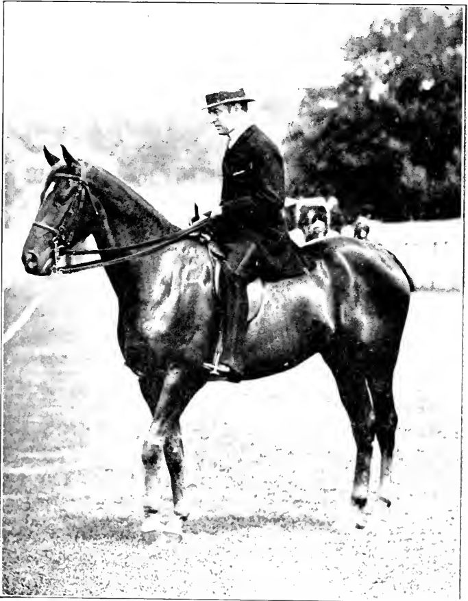
CORNELIUS VANDERBILT, Grandson of Commodore Vanderbilt.