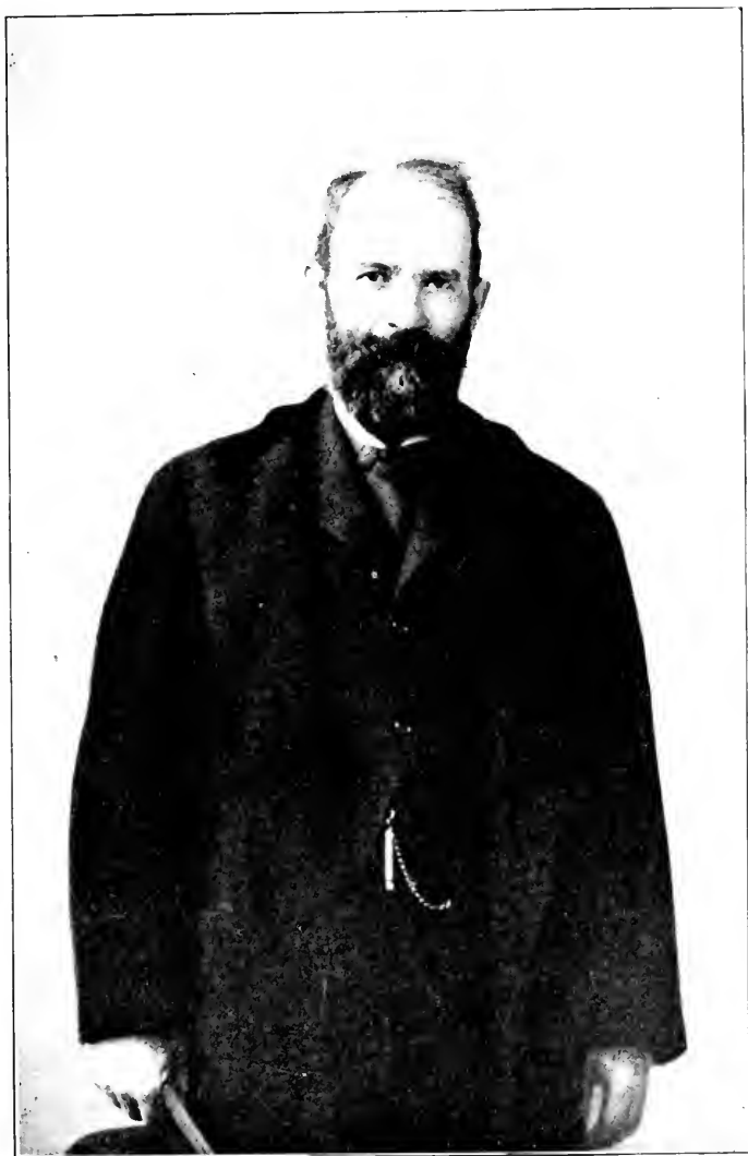
JAY GOULD, Who, in a Brief Period, Possessed Himself of a Vast Fortune.