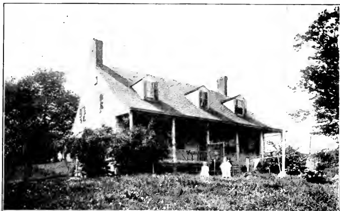
THE ORIGINAL VANDERBILT HOMESTEAD, Near New Dorp, Staten Island, N. Y.