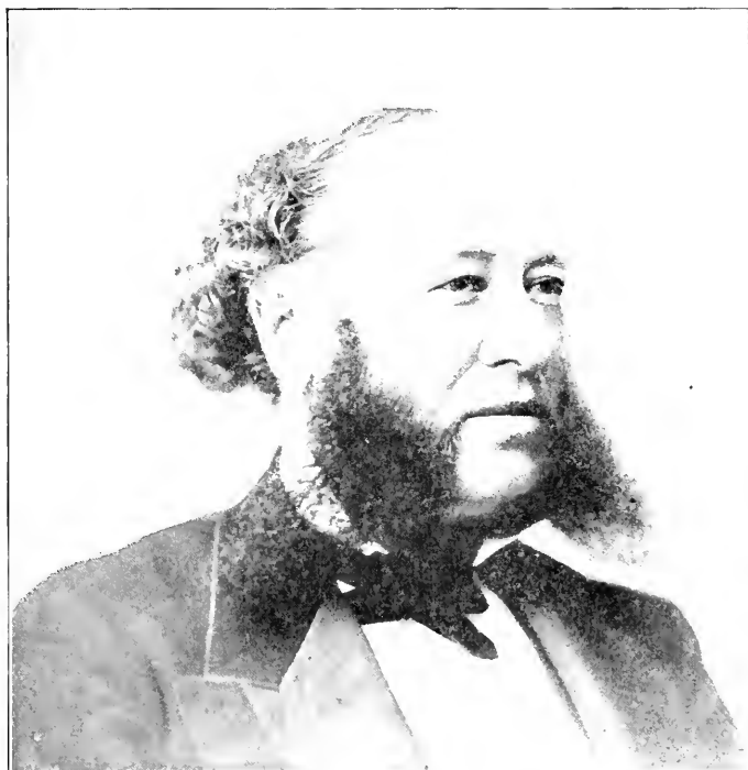
WILLIAM H. VANDERBILT, He Inherited the Bulk of His Father's Fortune and Doubled It.