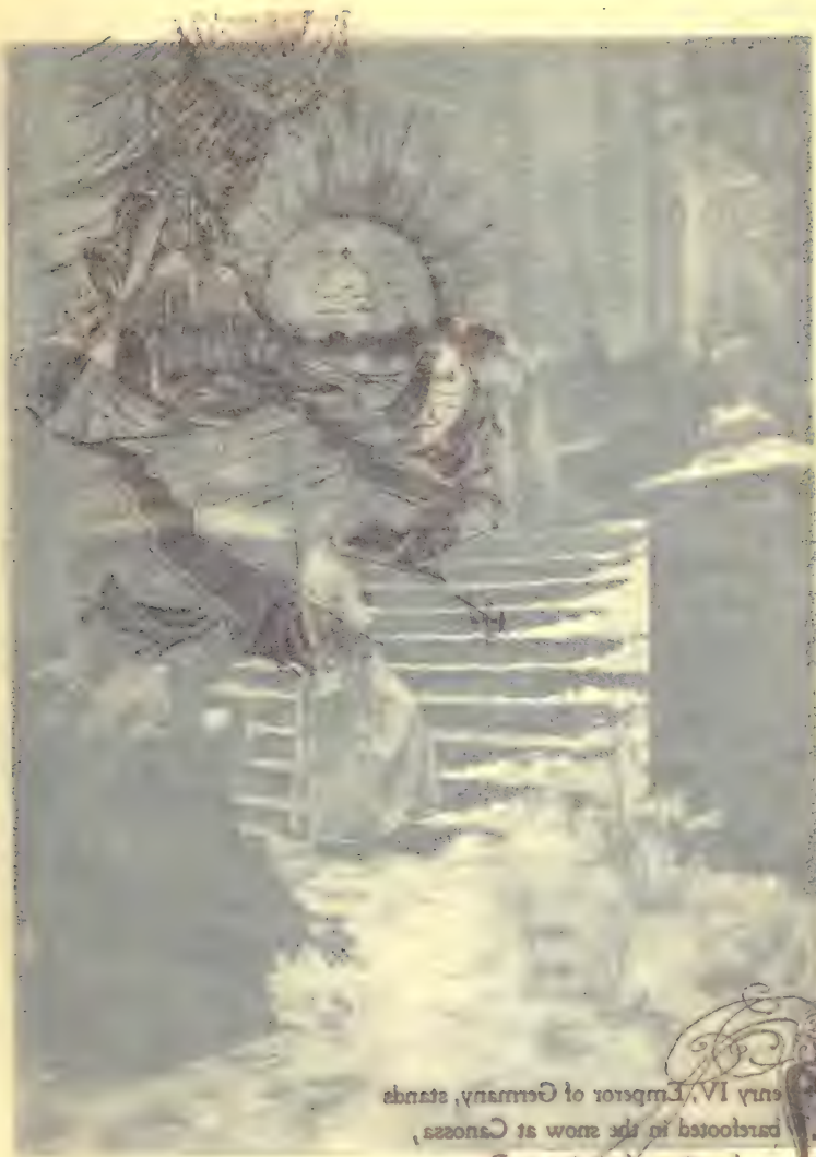
Emperor of Germany, stands partoced in the snow at Canosa, begging admision to Pope Gregory VII (Hildebrand) Painting by O. Friedrich.