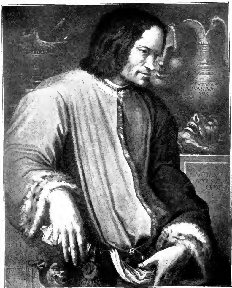
LORENZO DE MEDICI