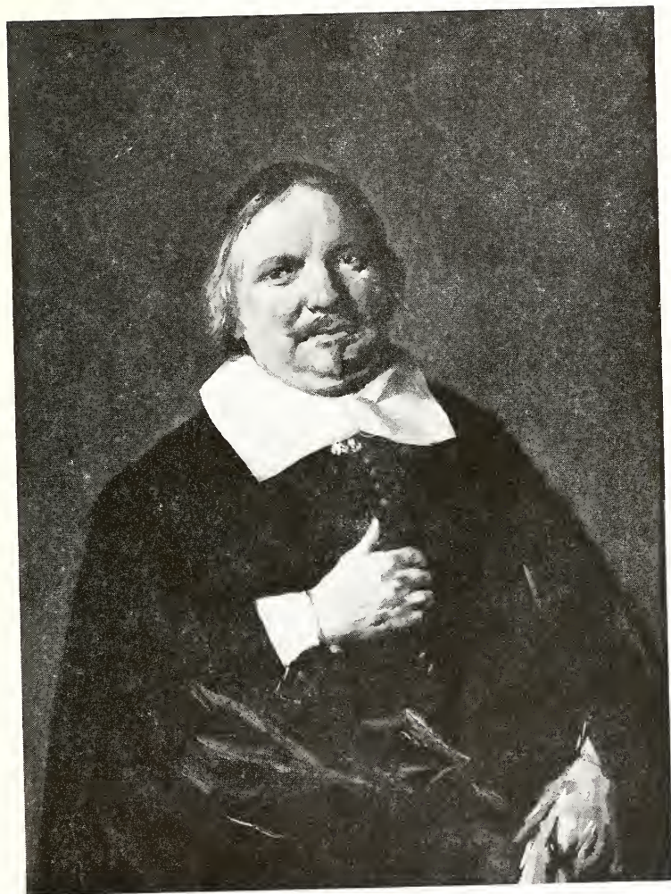
PORTRAIT OF CORNELIS GULDEWAGEN Trees Collection