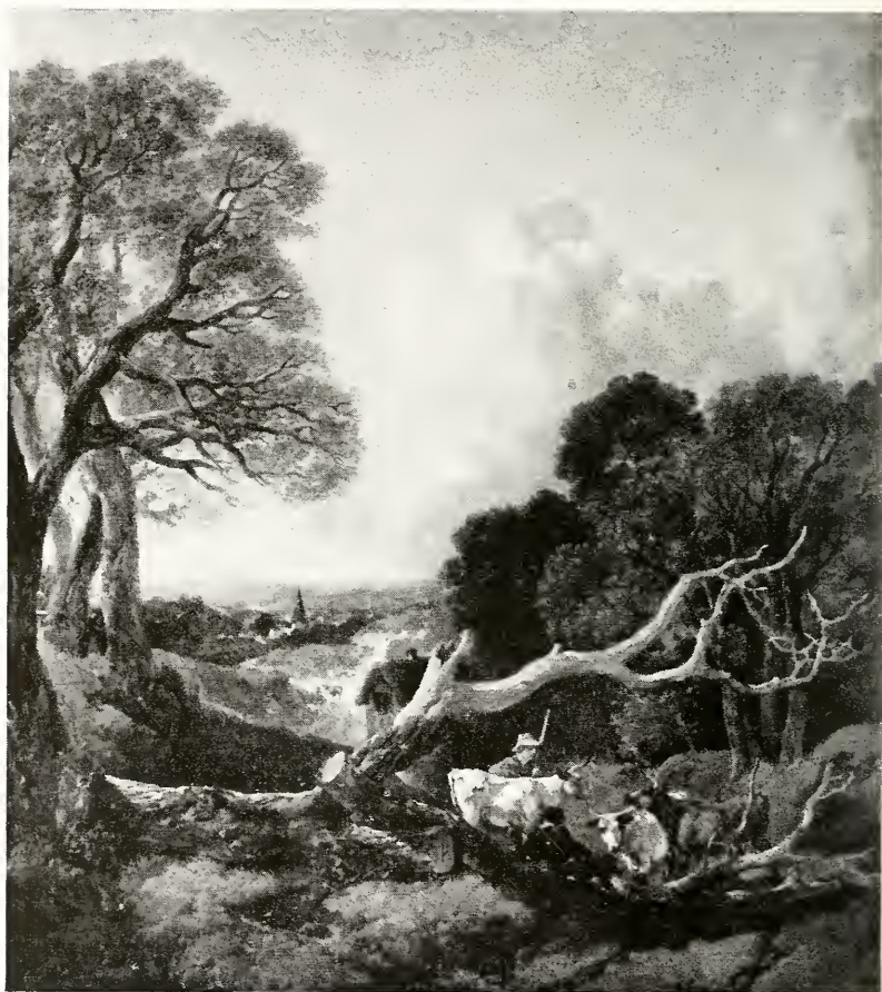
THE FALLEN TREE