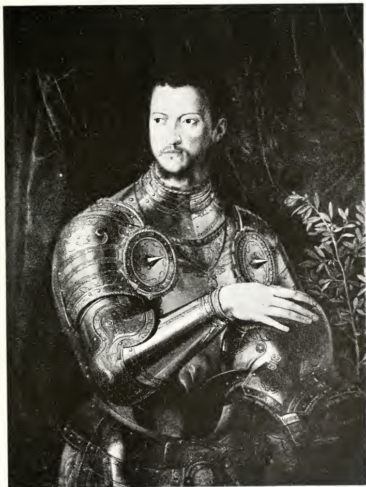
PORTRAIT OF COSIMO DE' MEDICI