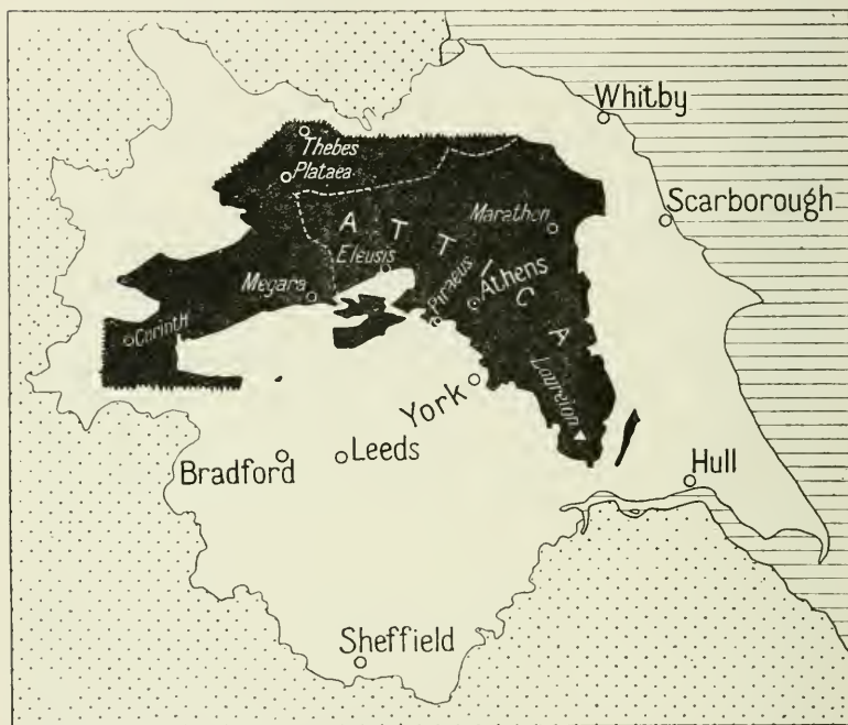
Attica, the Megarid, and parts of Corinth and Boeotia, with Yorkshire on the same scale.

These new demes formed the groundwork of the Athenian state in the fifth century. Every Athenian was a demesman, and officially known by the name of his deme. Cleisthenes