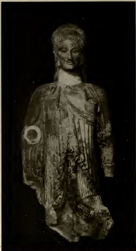
STATUE FROM THE ATHENIAN ACROPOLIS (Acropolis Museum No. 682)