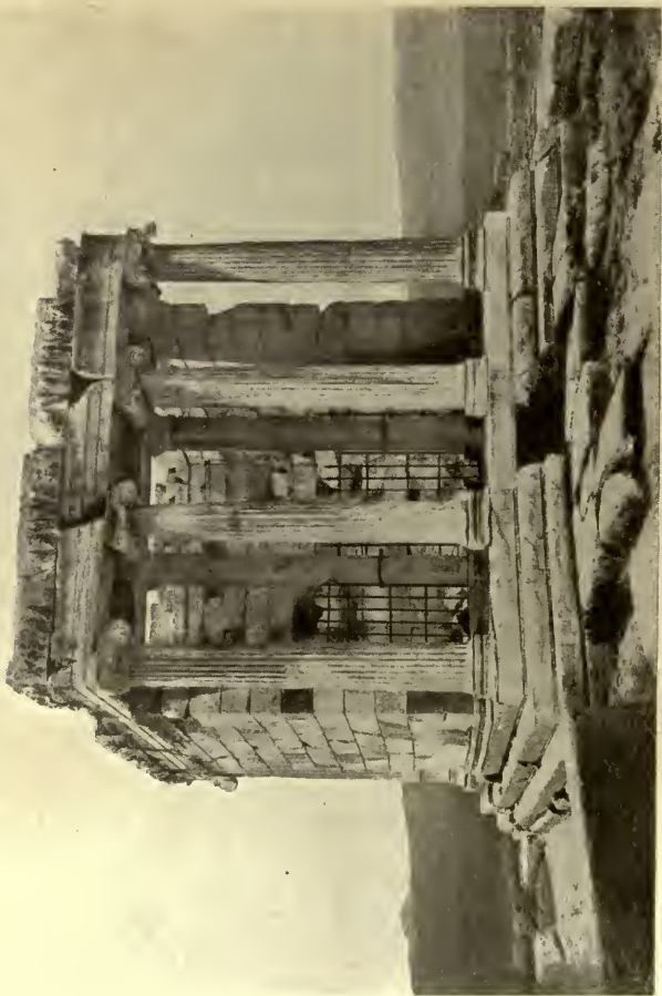
IONIC TEMPLE OF ATHENA NIKE AT ATHENS