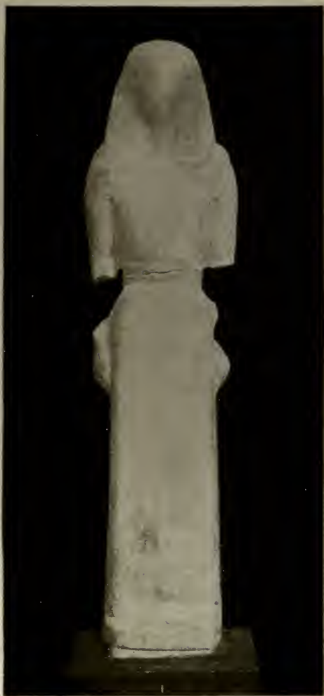
ARTEMIS FROM DELOS (Athens Museum)