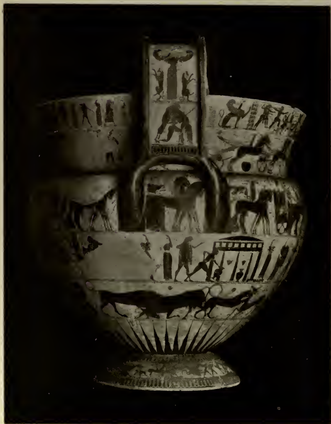
ATTIC BLACK FIGURE VASE (The François Vase, Florence Museum)