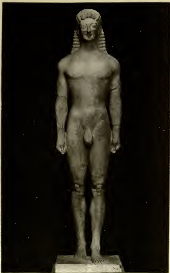
APOLLO FROM TENEA (Munich Museum)