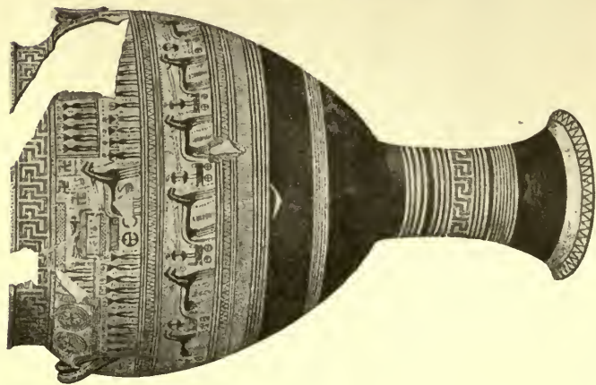
(a) GEOMETRIC VASE FROM DIPYLON CEMETERY IN ATHENS (Athens Museum)