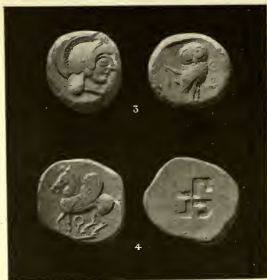
COINS OF LYDIA (?), AEGINA, ATHENS, AND CORINTH