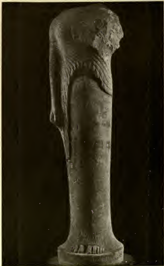
HERA FROM SAMOS (Louvre Museum, Paris)