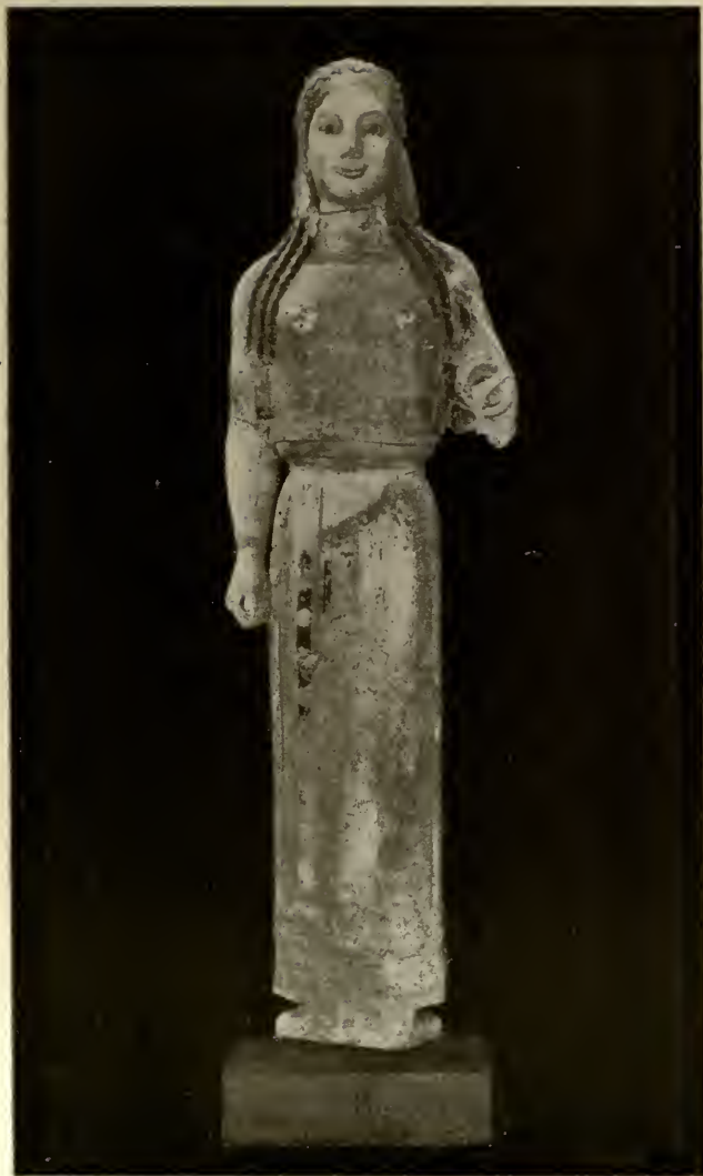
STATUE FROM THE ATHENIAN ACROPOLIS (Acropolis Museum No. 679)