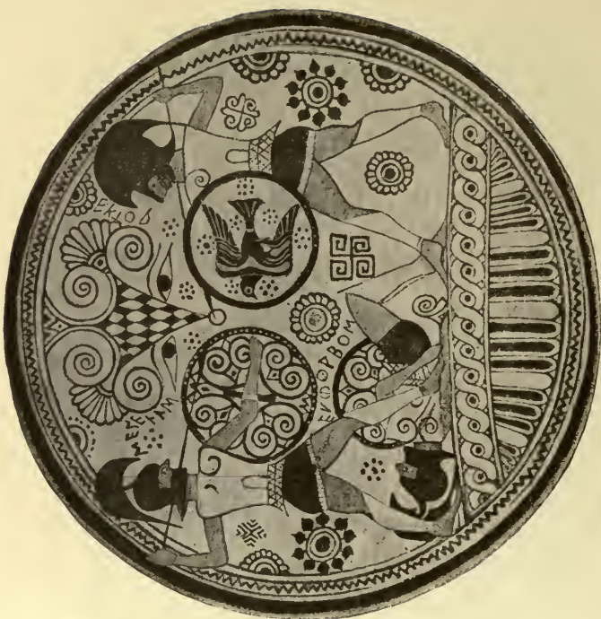
(b) PLATE FROM RHODES (British Museum)