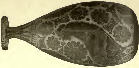
CORINTHIAN VASES (British Museum)