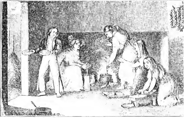
A Kitchen Scene