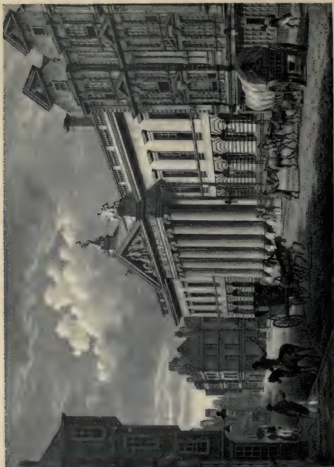
EAST INDIA HOUSE, LEADENHALL STREET, E.C., AT THE DATE OF THE DISSOLUTION OF THE EAST INDIA COMPANY (PULLED DOWN IN 1862)