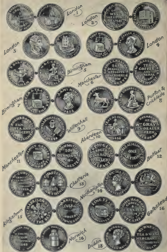
TOKENS ISSUED BY GROCERS, NINETEENTH CENTURY