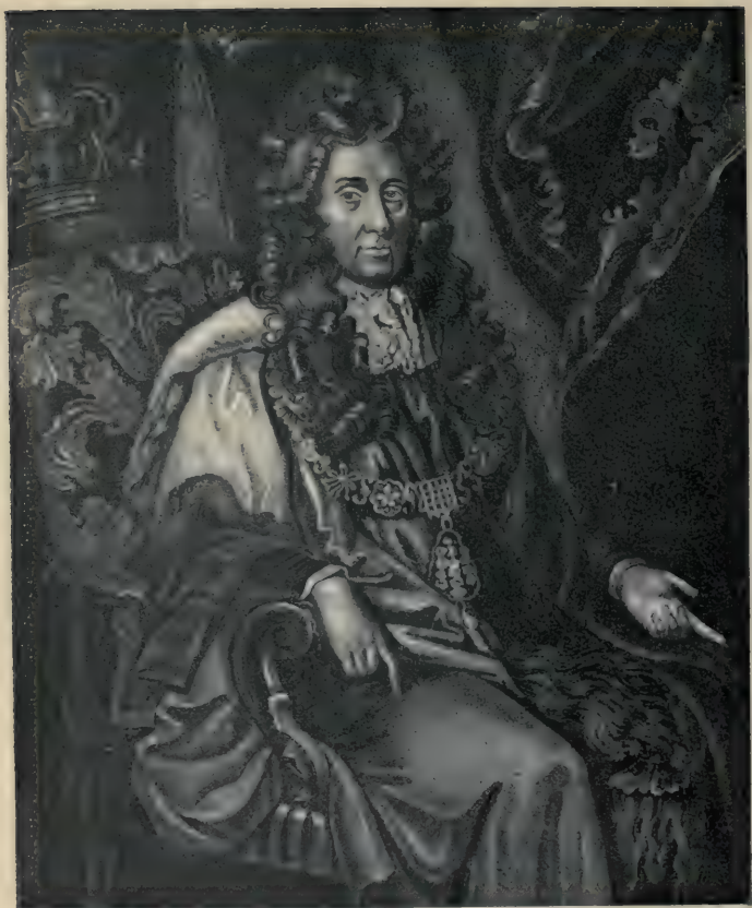
SIR JOHN MOORE, GROCER, LORD MAYOR OF LONDON 1681