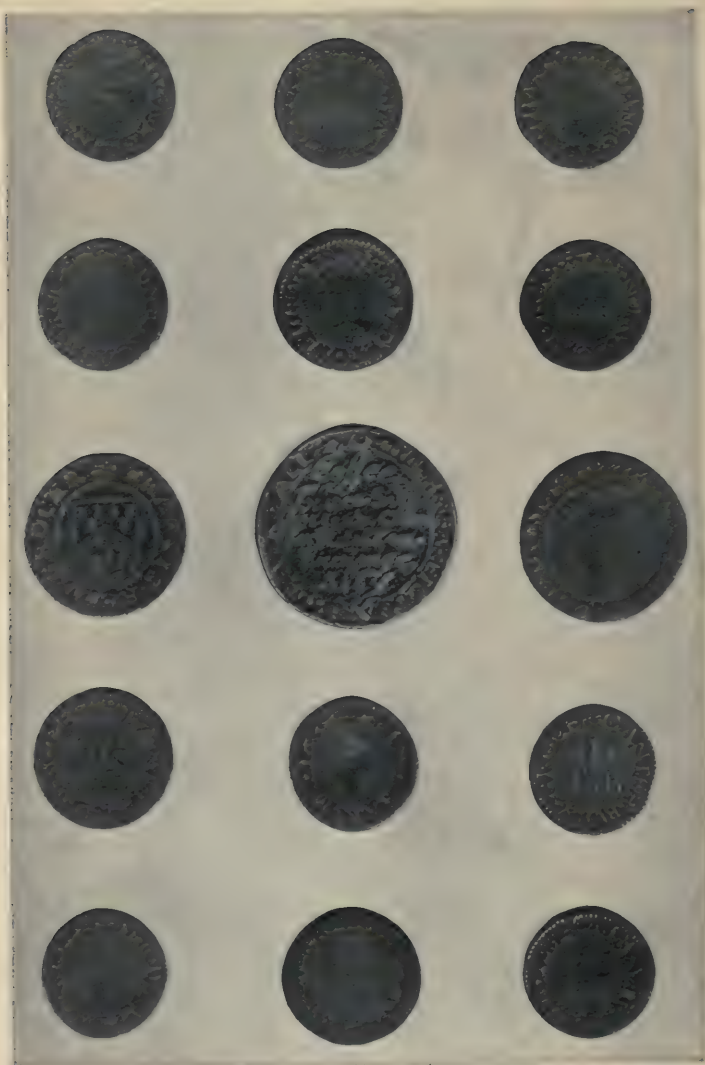
TOKENS ISSUED BY GROCERS, SEVENTEENTH CENTURY