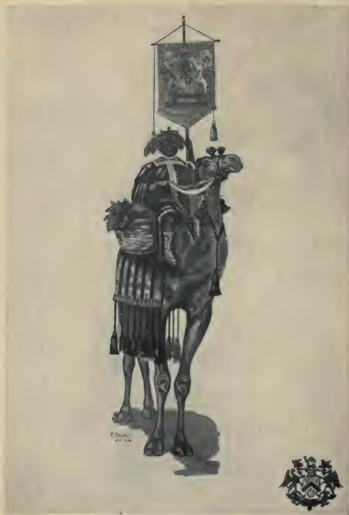
A FEATURE OF THE PAGEANT, SEVENTEENTH CENTURY