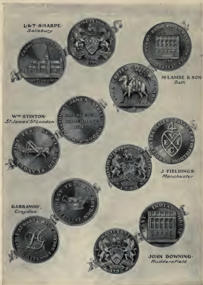
TOKENS ISSUED BY GROCERS, EIGHTEENTH CENTURY