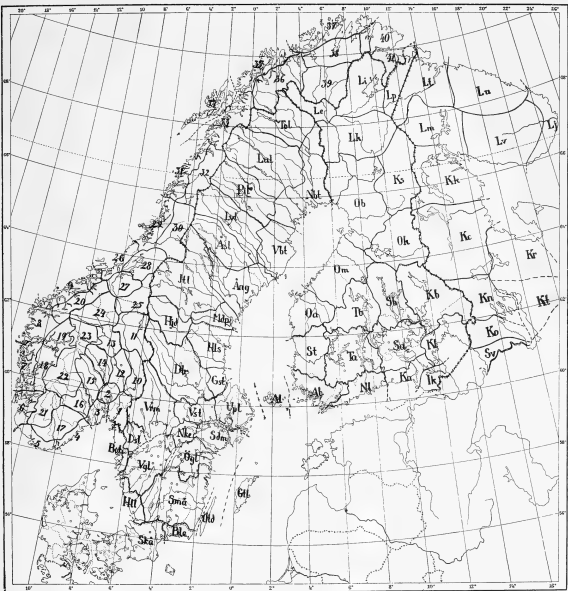
MAP OF FENNOSCANDIA