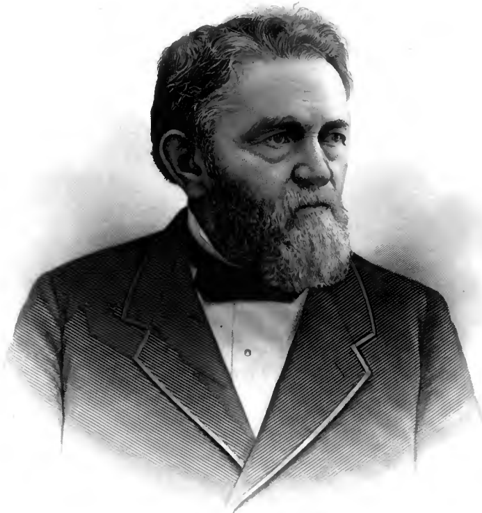
Magazine of Western History