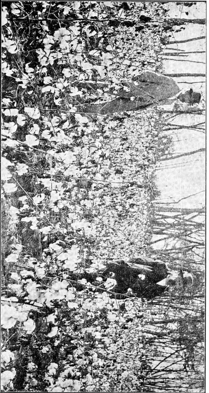
SECTION OF COTTON FIELD PRODUCING 4,200 POUNDS SEED COTTON PER ACRE, MANAGED ACCORDING TO DIRECTIONS HEREIN GIVEN.