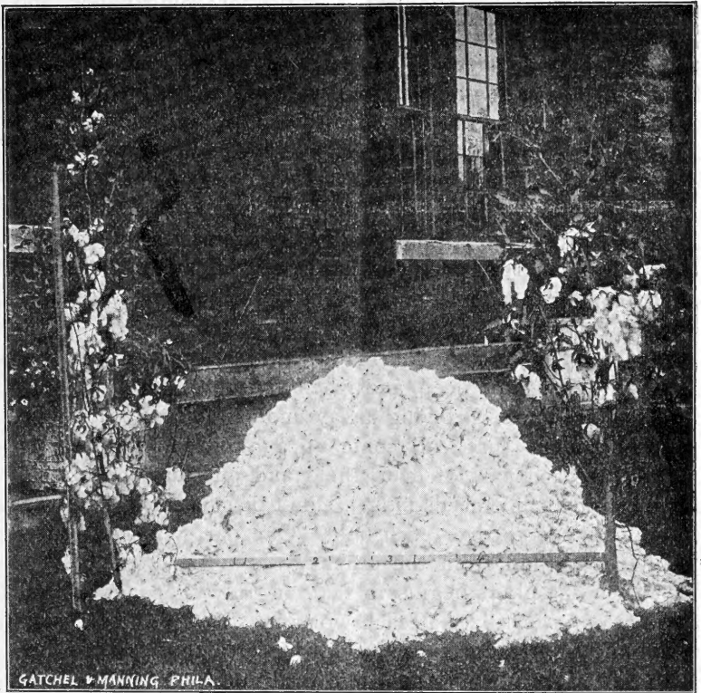
No. 2.—COTTON FROM SAME AREA AS NO. 1, BUT FERTILIZED AND CULTIVATED AFTER IMPROVED METHODS DESCRIBED HEREIN.

You know about what size stalk you will get. Thin the crop according to the quality of your land.