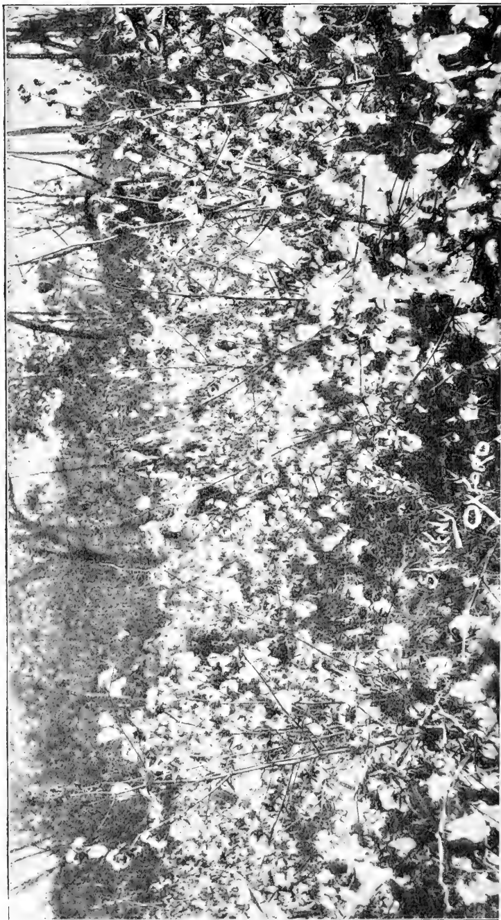
SECTION OF COTTON FIELD PRODUCING 1,300 POUNDS SEED COTTON PER ACRE WITHOUT FERTILIZER, BUT "CULTIVATED" AFTER THE IMPROVED METHODS DESCRIBED HERIN.