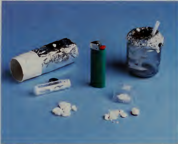
Two types of homemade crack pipes.