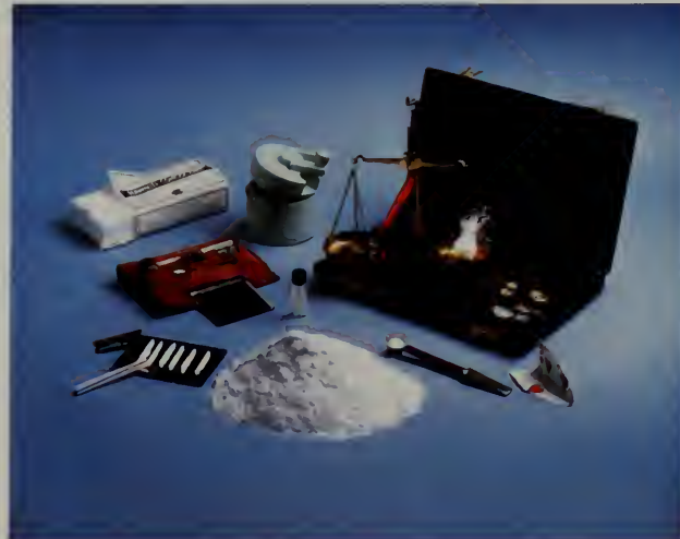
Cocaine paraphernalia includes mirrors, razor blades, and scales used by drug dealers.

Positive answers to any of these questions can indicate alcohol or other drug use. However, these signs may also apply to a child who is not using drugs but who may be having other problems at school or in the family. If you are in doubt, get help. Have your family doctor or local clinic examine your child to rule out illness or other physical problems.