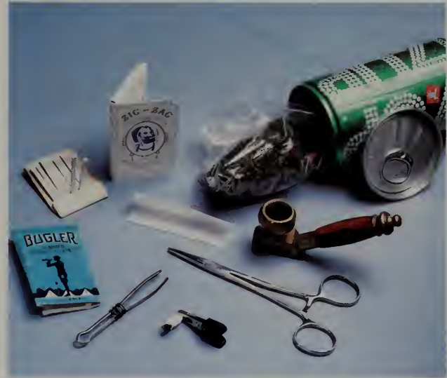
Marijuana paraphernalia includes rolling papers, clips, and pipes.