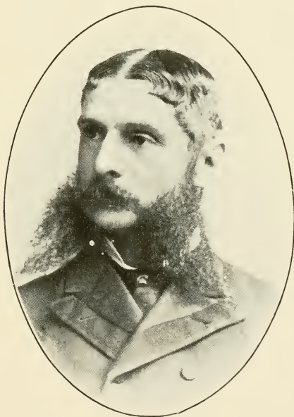
GENERAL E. BURD GRUBB