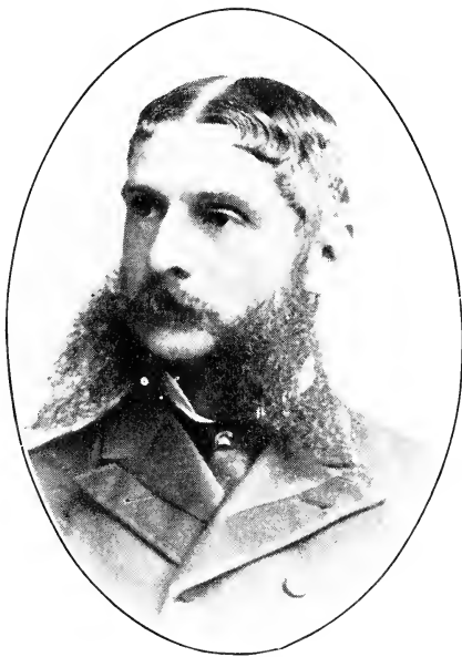
GENERAL E. BURD GRUBB