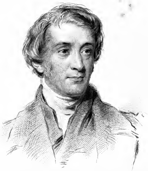
Julius Charles Hare.