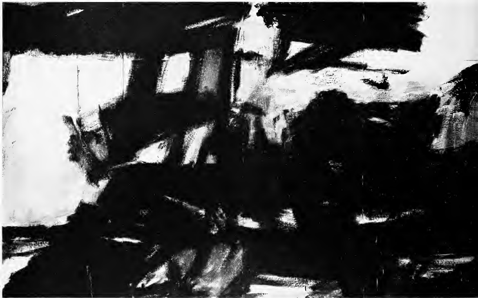
HONORABLE MENTION Franz Kline 1960 NEW YEAR WALL: NIGHT