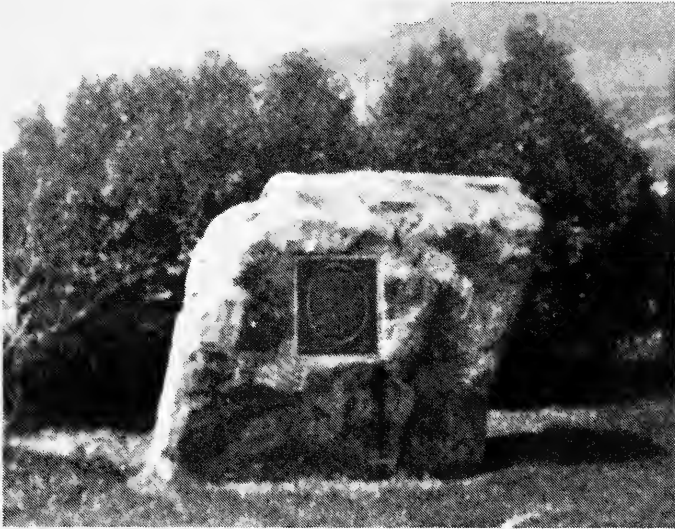
First Night Football Monument Smythe Park, Mansfield, PA.

Published by Tioga Lake and Canyon Country Assoc.