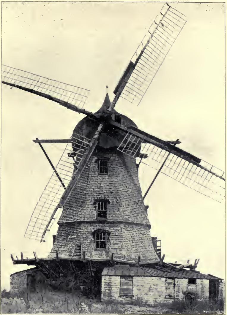
THE OLD WINDMILL AT LAWRENCE.

This quaint old structure stands upon a hill overlooking Lawrence. It is the only one of its kind and size in the United States, and is an object of interest to thousands of visitors who annually visit the Historic City. It is a landmark which is cherished by the citizens of the town, more especially by the old residents. It was built in 1863, the year of the raid, at a cost of $9,700, by twelve skilled workmen brought over from Sweden for the purpose. It is of true Holland style, and is an unusually large windmill. The foundation is forty feet across, the revolving cap in the dome being twenty feet in diameter. The arms are forty feet in length, the sails, or wing boards, being ten feet in width. With the wind blowing at twenty miles an hour the capacity of the mill was eighty horse power. It is four stories high, and was originally used for grinding wheat and corn. Later it was used as a machine shop, for the manufacture of farm implements. It made its last run in July, 1885. It has been purchased by the Associated Charities of Lawrence, and will eventually be made a museum and place of historic resort.