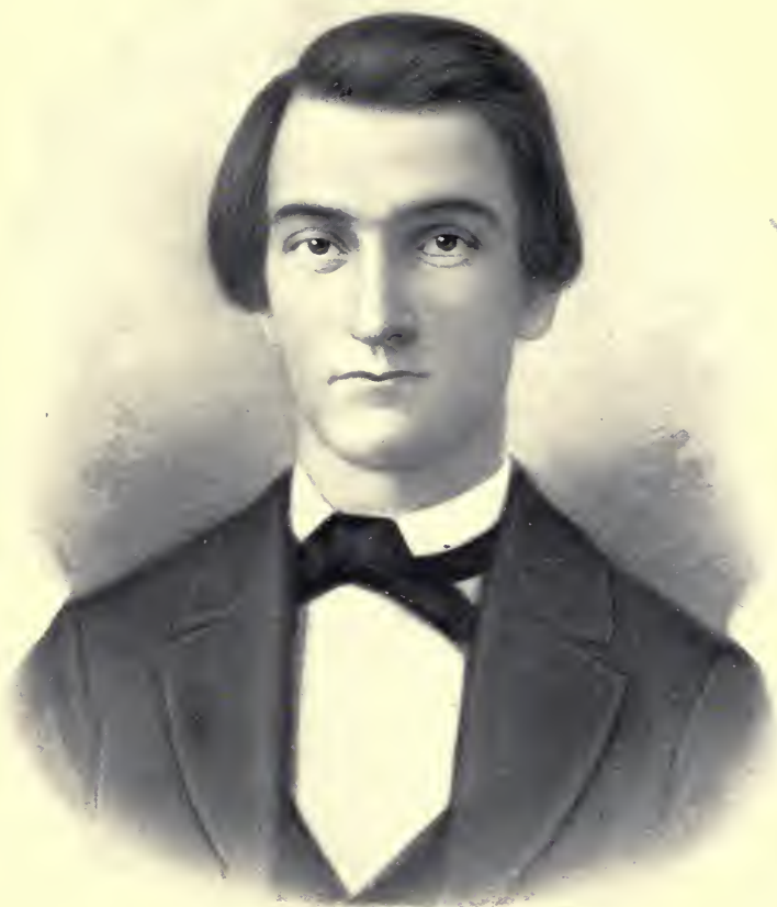
THE AUTHOR AT THIRTY