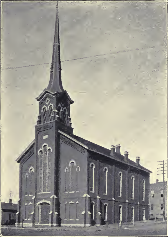
METHODIST EPISCOPAL CHURCH AT ATCHISON.