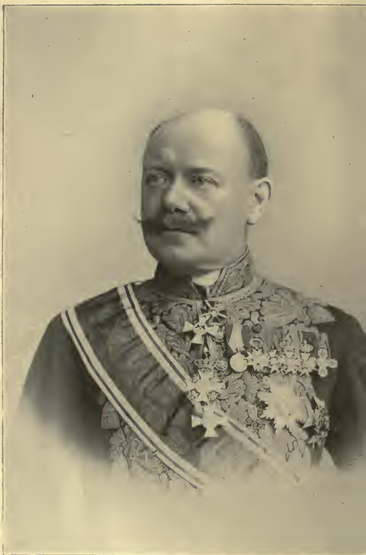
COUNT MICHEL NICOLAIEVITCH MOURAVIEW

Russian Minister of Foreign Affairs and reputed author of the dis- armament proposition