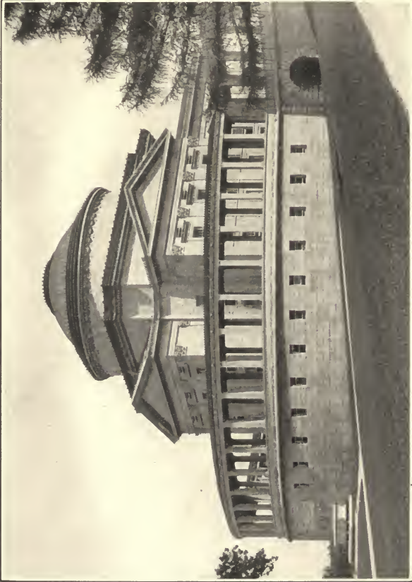
THE HALL OF FAME