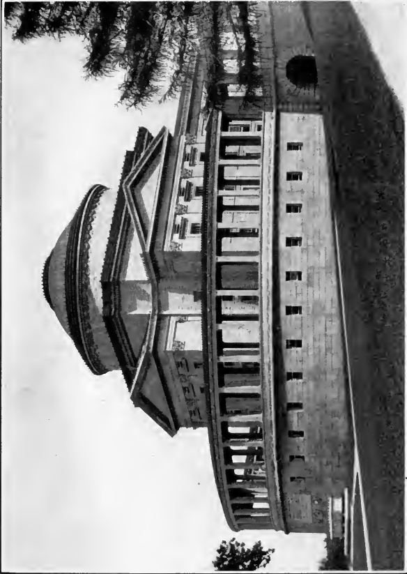
THE HALL OF FAME