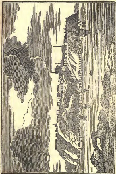
VIEW OF QUEBEC.