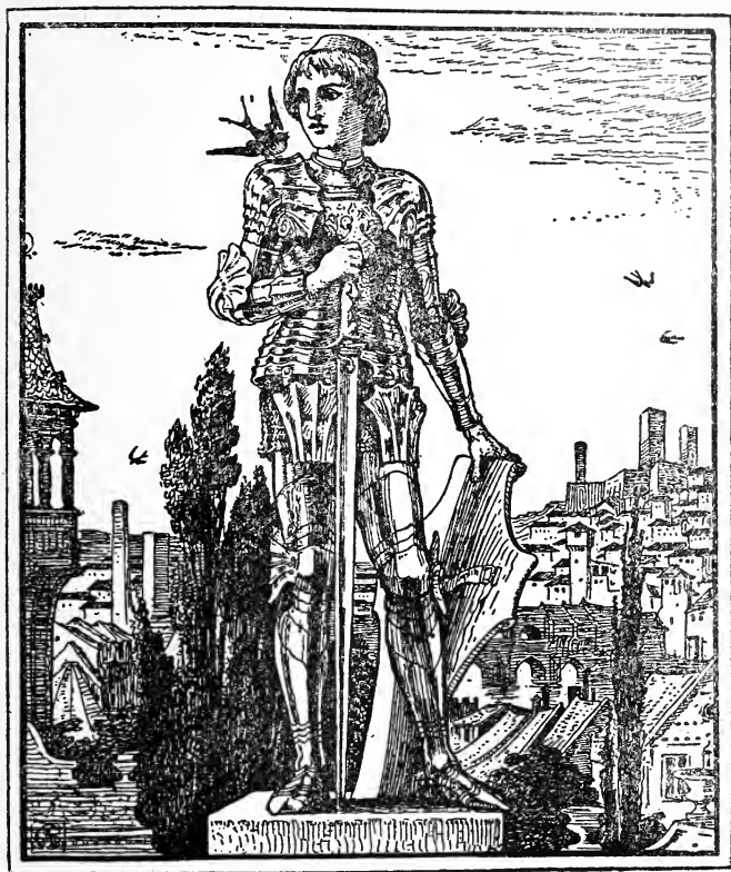
The Happy Prince Drawn by Walter Crane