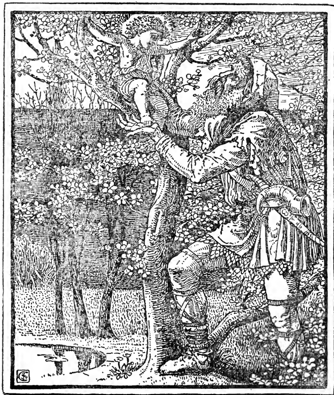
The Selfish Giant Drawn by Walter Crane