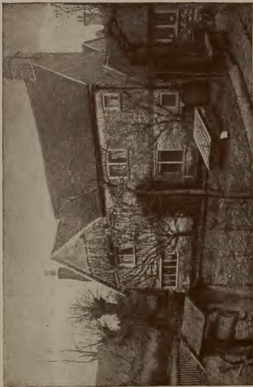
Milton's Cottage, Chalfont St. Giles, from the garden The only house now standing in which Milton is known to have lived