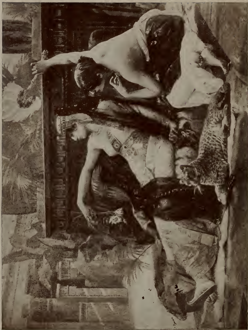
Cleopatra. From the painting by Alex. Cabanel