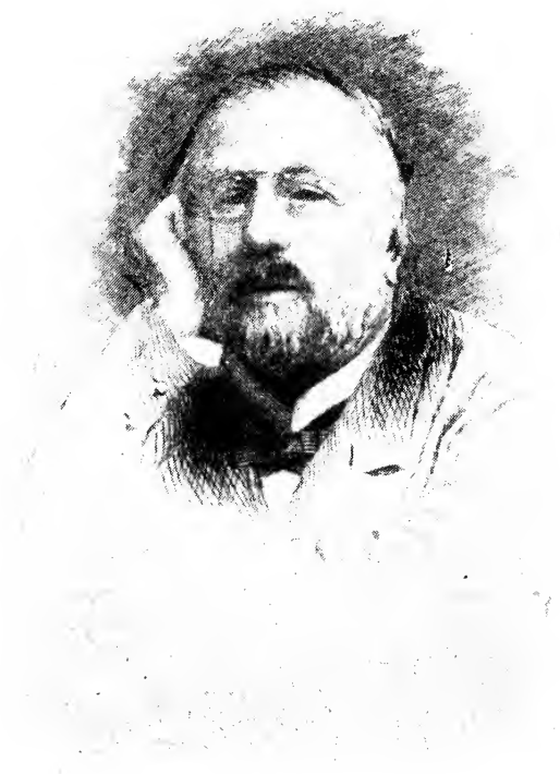
Hippolyte Adolphe Taine From the etching by Asher B. Durand