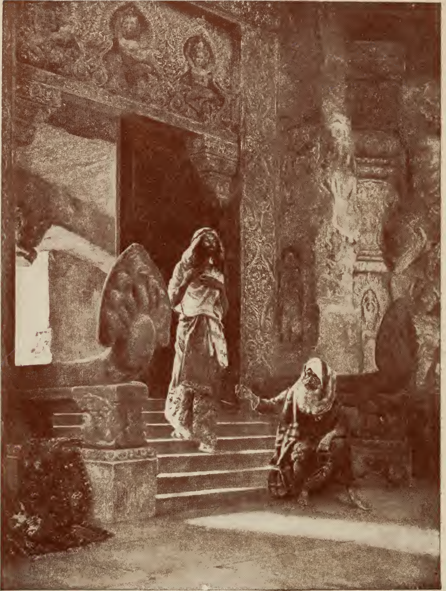
A Hindu Temple From the painting by R. Ernst