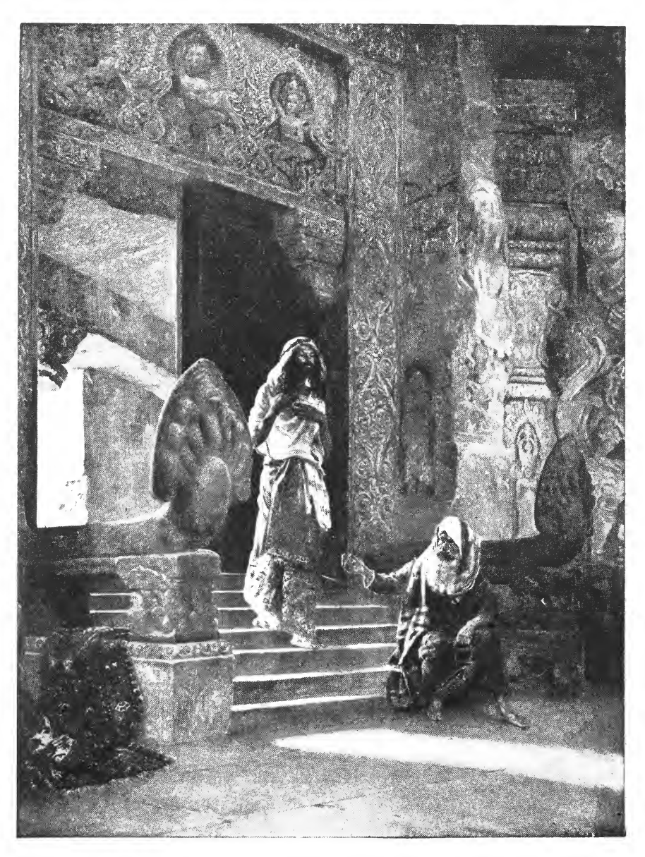
A Hindu Temple From the painting by R. Ernst