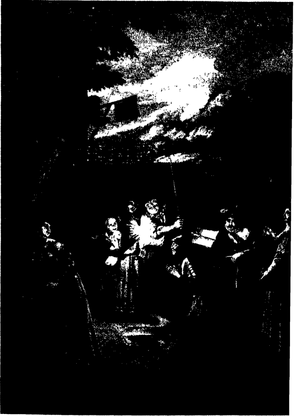
Don Quixote commanded to kneel