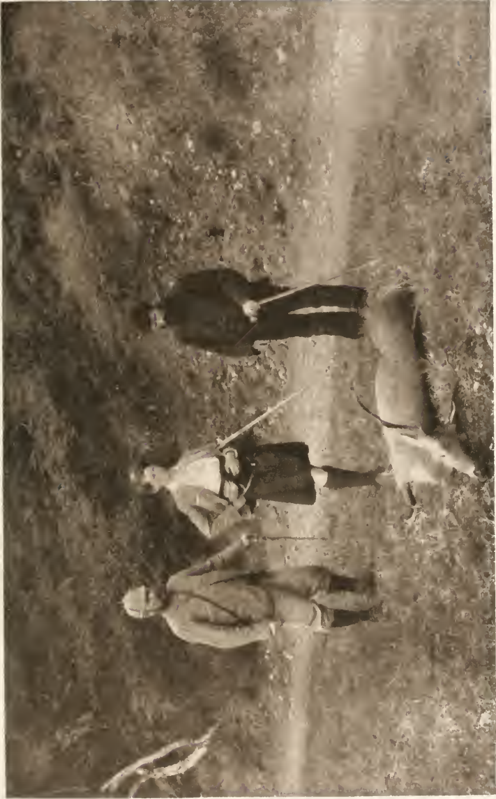
His first dog, 1889