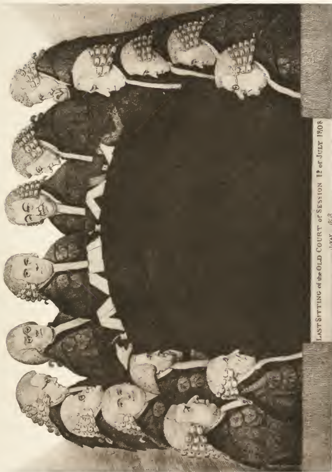
LAST SITTING of the OLD COURT of SESSION 12 of JULY 1828 1844 1828