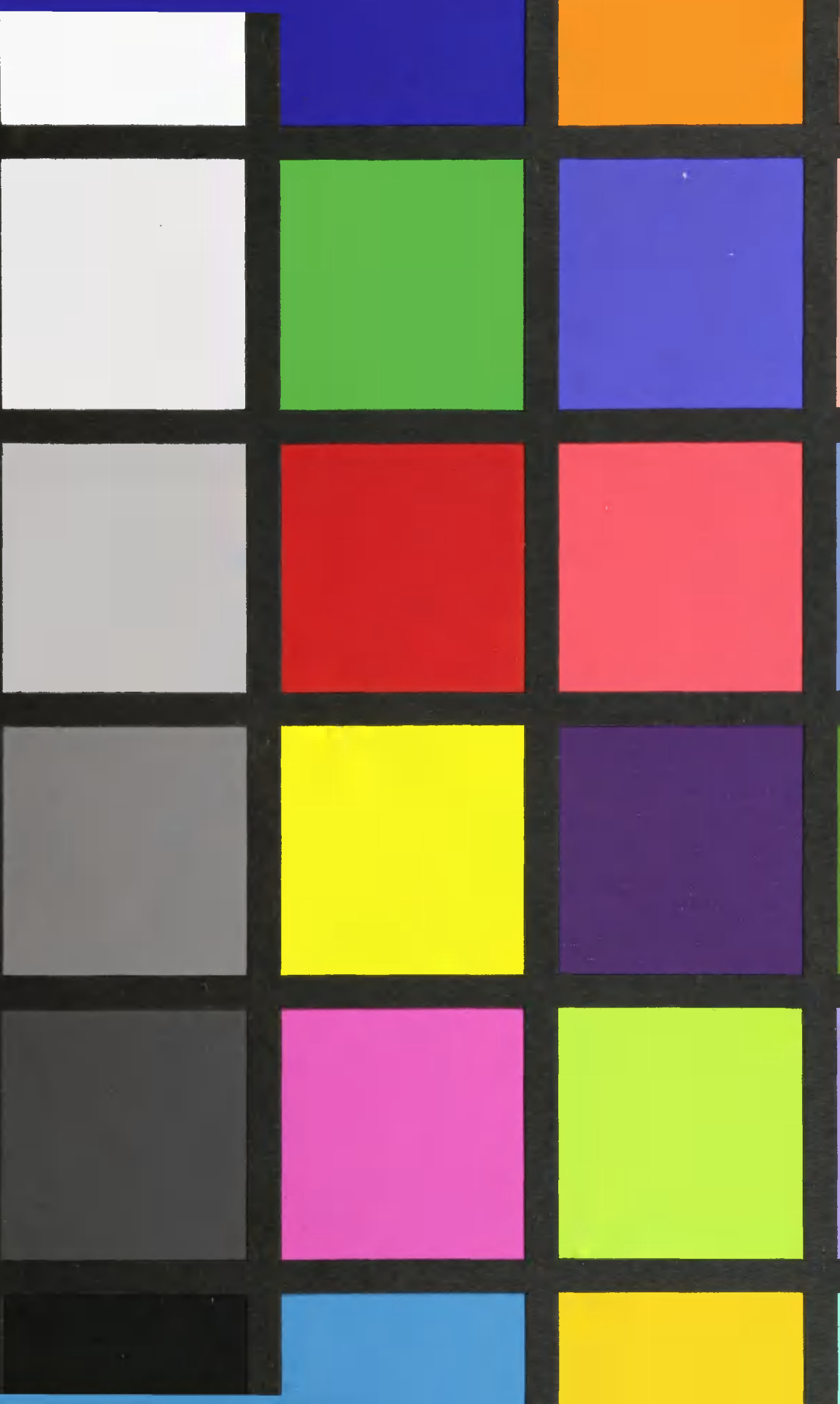
GretagMachbeth™ ColorChecker Color Rendition Chart