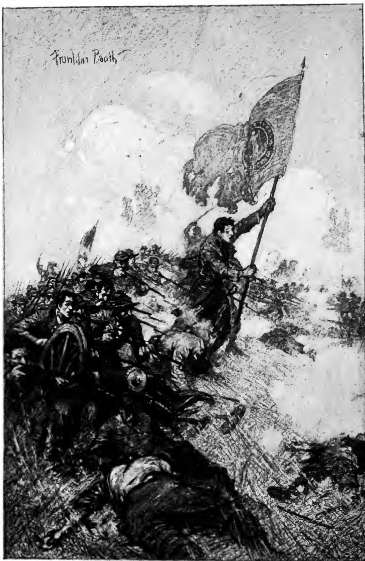
Two lines of their infantry were driven back; two lines of guns were taken—and no support came.—Page 106.