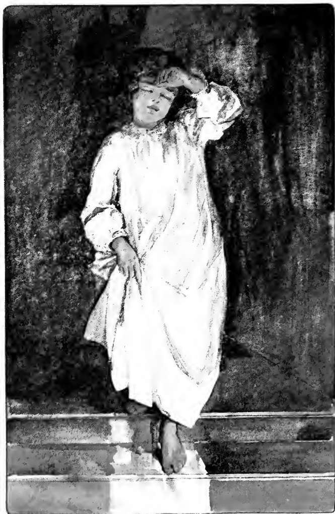
The pale moonlight . . . lighted up a white form