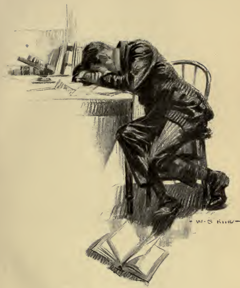
He felt stricken, broken, overwhelmed. Page 26.