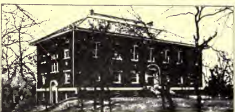
The New Smith Gymnasium.—One of Beloit's Fourteen Buildings.

—U. S. Senator Albert J. Beveridge, in Saturday Evening Post, June 10, 1905.