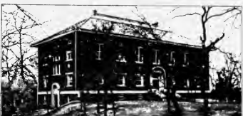
The New Smith Gymnasium—One of Beloit's Fourteen Buildings.