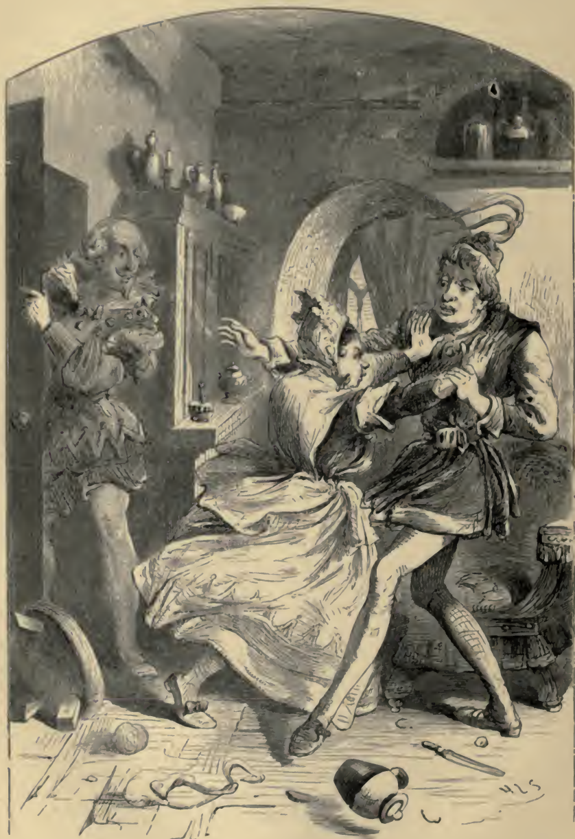
GAMMER GURTON'S NEEDLE.