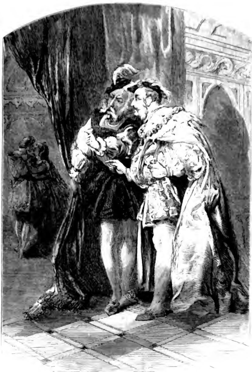
"THE QUEEN," MURMURED HENRY