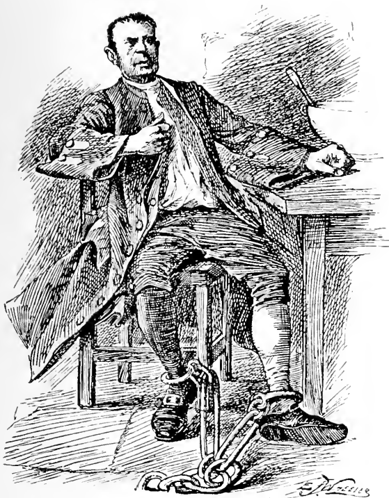
Jonathan Wild in Prison.