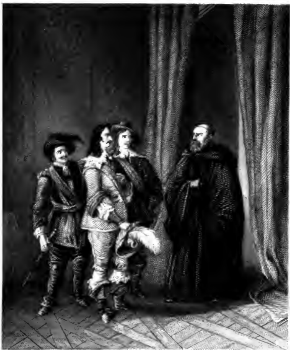
Three figures in historical or theatrical costumes.