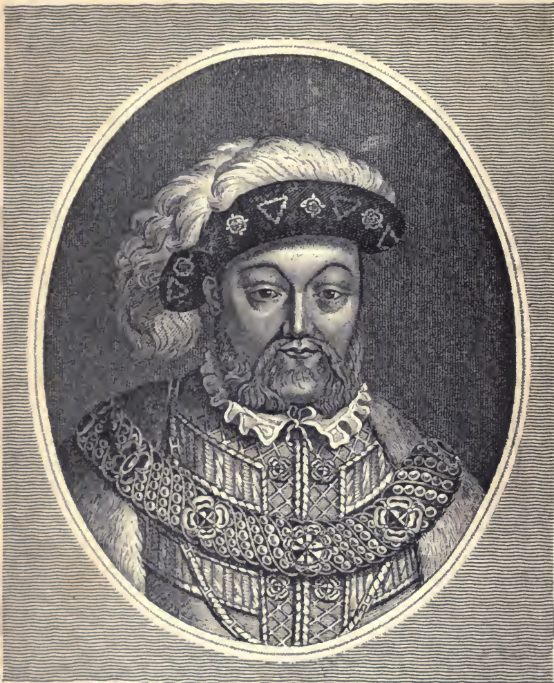
King Henry VIII.