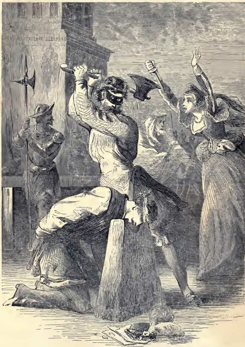
THE EXECUTION OF HENRY HOWARD.