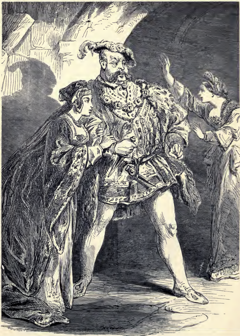
THE APPEAL OF ANNE ASKEW.