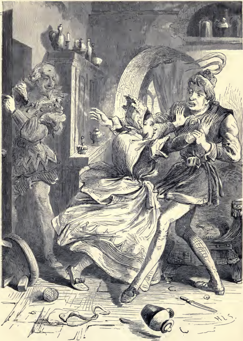
GAMMER GURTON'S QUARREL WITH HODGE.