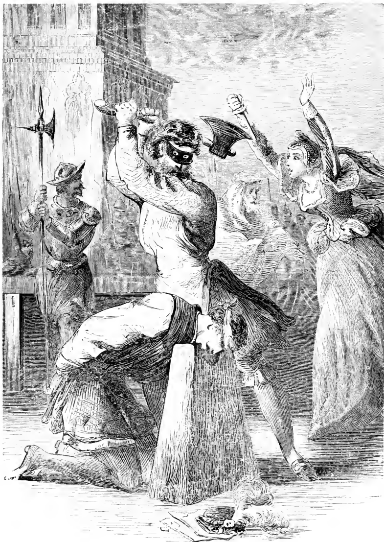
THE EXECUTION OF HENRY HOWARD.