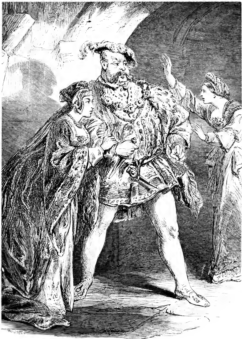
THE APPEAL OF ANNE ASKEW.