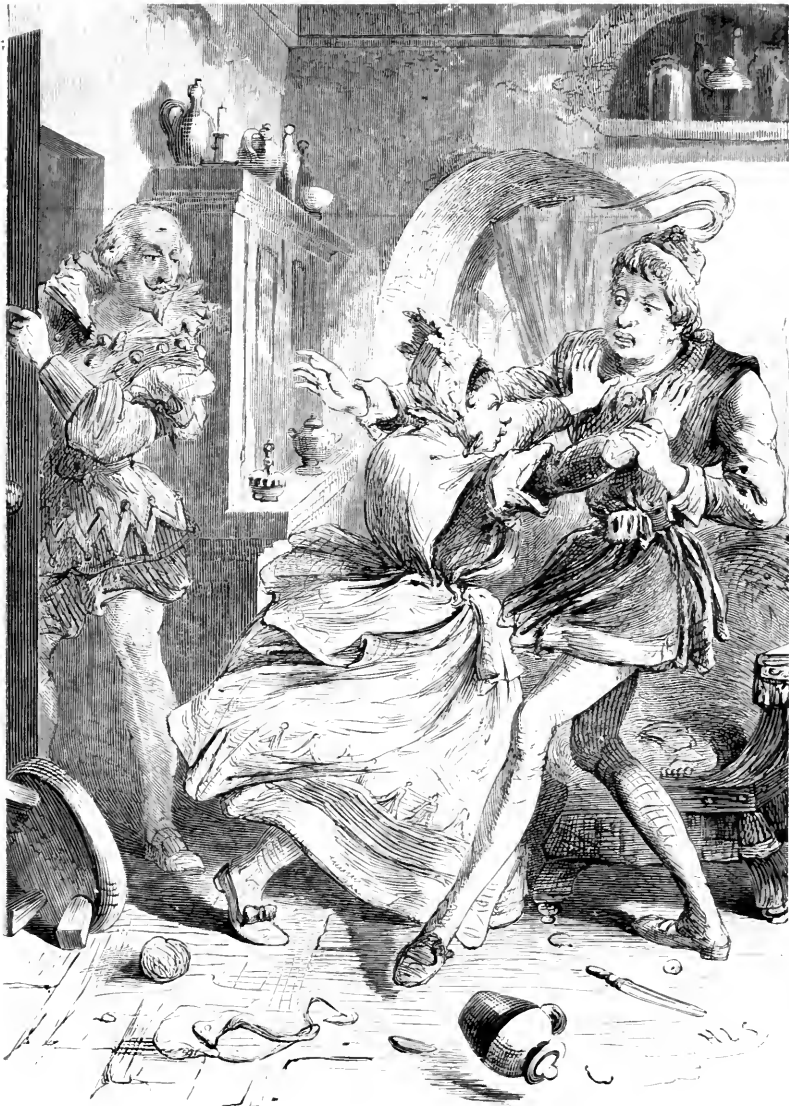
GAMMER GURTON'S QUARREL WITH HODGE.