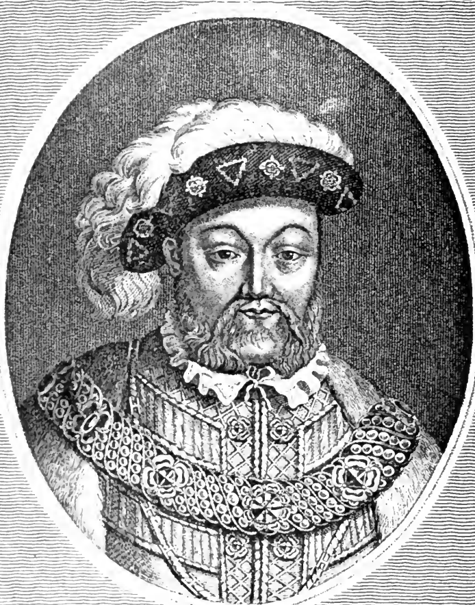
King Henry VIII.