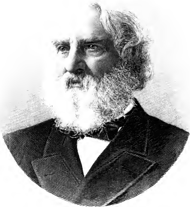
Henry W. Longfellow 1879