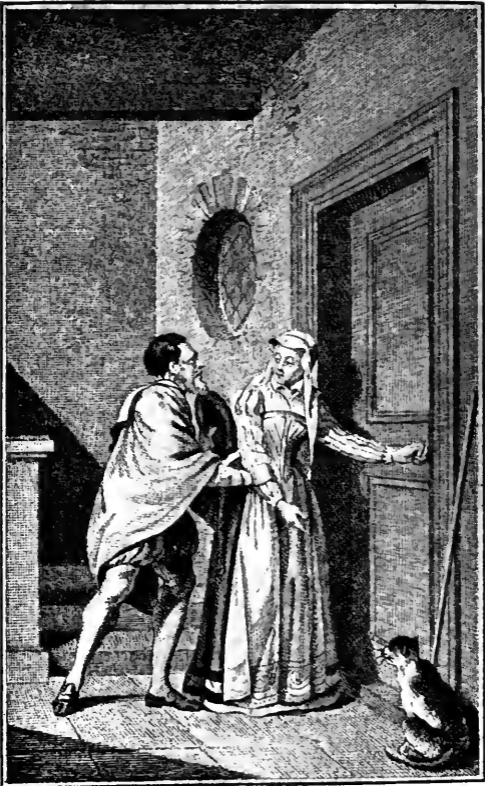
DAY III. TALE XXVII.