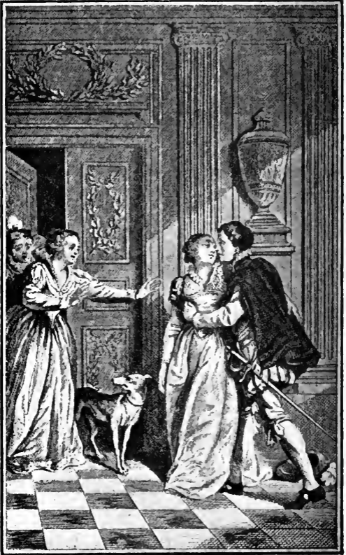
DAY II. TALE XIX.