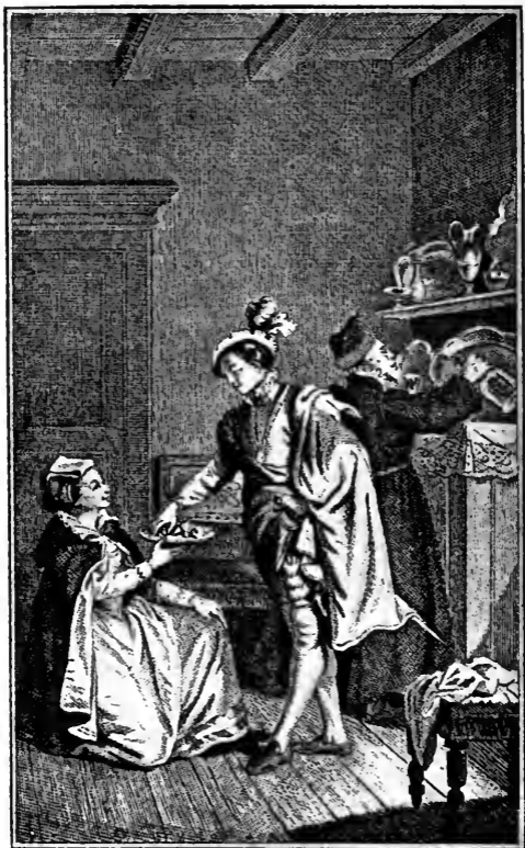
DAY III. TALE XXV.