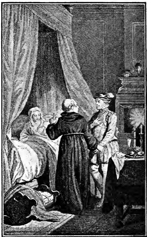
DAY III. TALE XXIII.