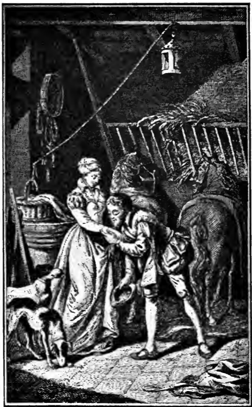
DAY III. TALE XXVI.