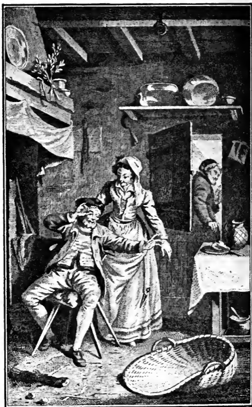
DAY III. TALE XXIX.