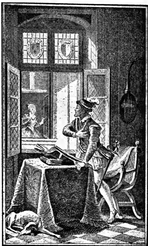
DAY III. TALE XXI.