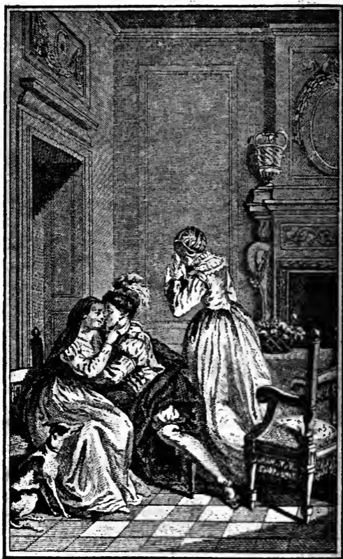
DAY III. TALE XXX.