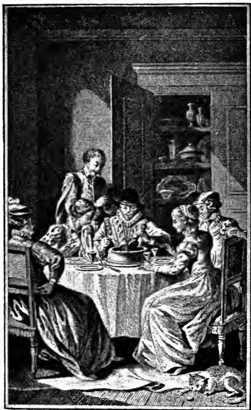
DAY III. TALE XXVIII.