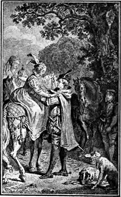
DAY III. TALE XXIV.