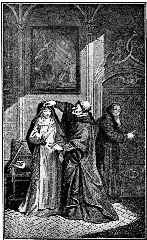
DAY III. TALE XXII.