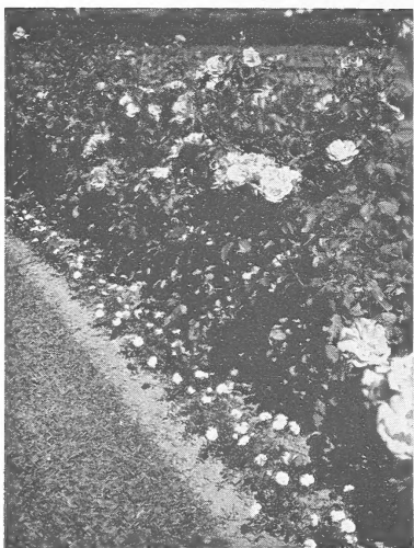
"Pixie" edging a bed of Roses

Fads pay. They start talking . . . . and buying. One woman tells another . . . . and profits begin to climb. The most powerful sales stimulus is word-of-mouth advertising.