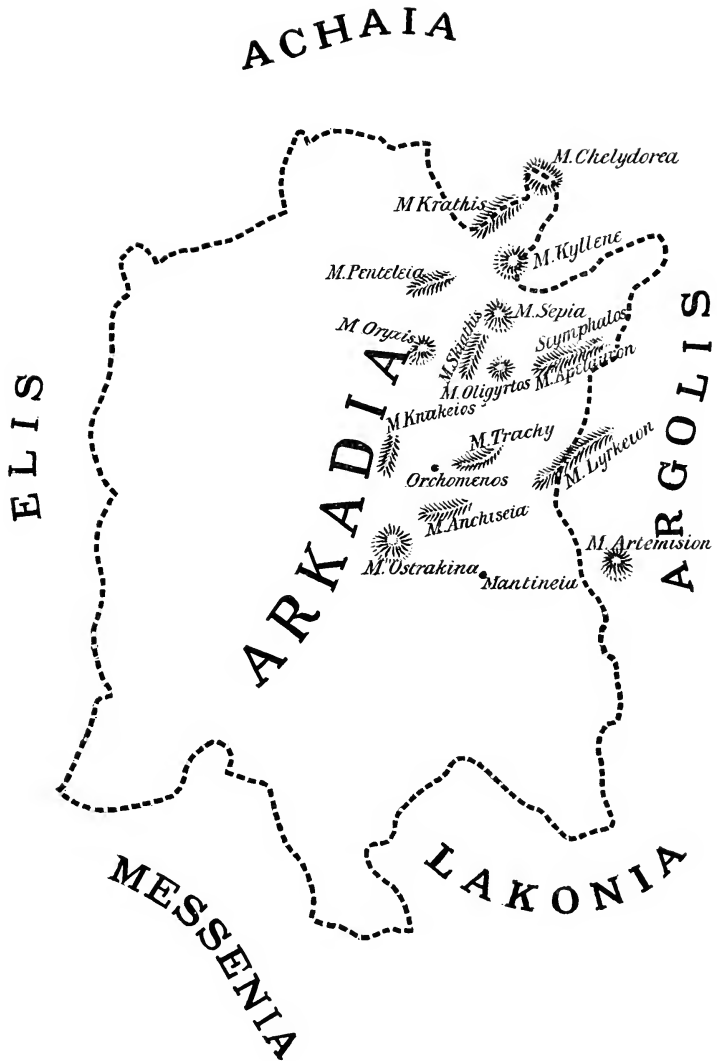
MAP ILLUSTRATING HERMAS' VISIT TO ARCADIA