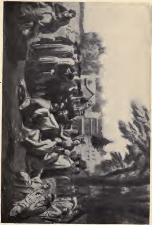
WEST'S PICTURE OF PENN.'S TREATY