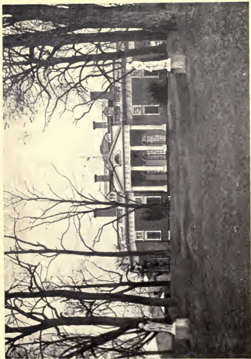
MONTICELLO, THE HOME OF THOMAS JEFFERSON