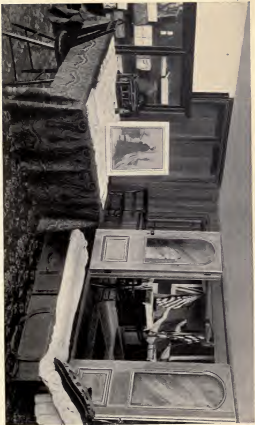
DINING-ROOM AND OFFICE IN CLARA BARTON'S HOME