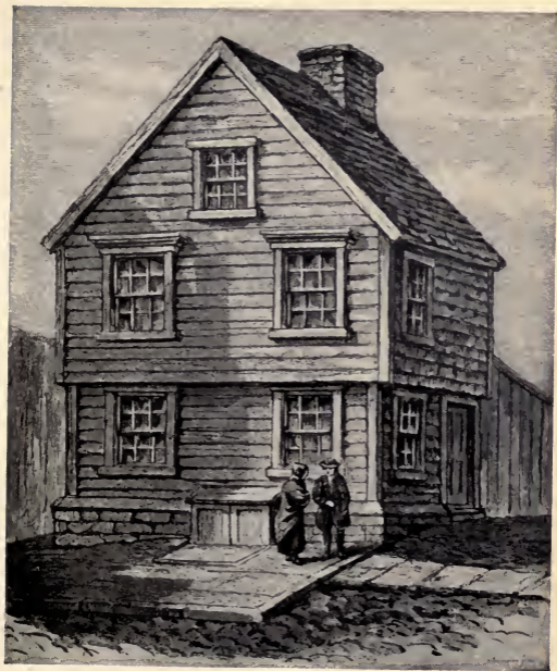
HOUSE IN WHICH FRANKLIN WAS BORN