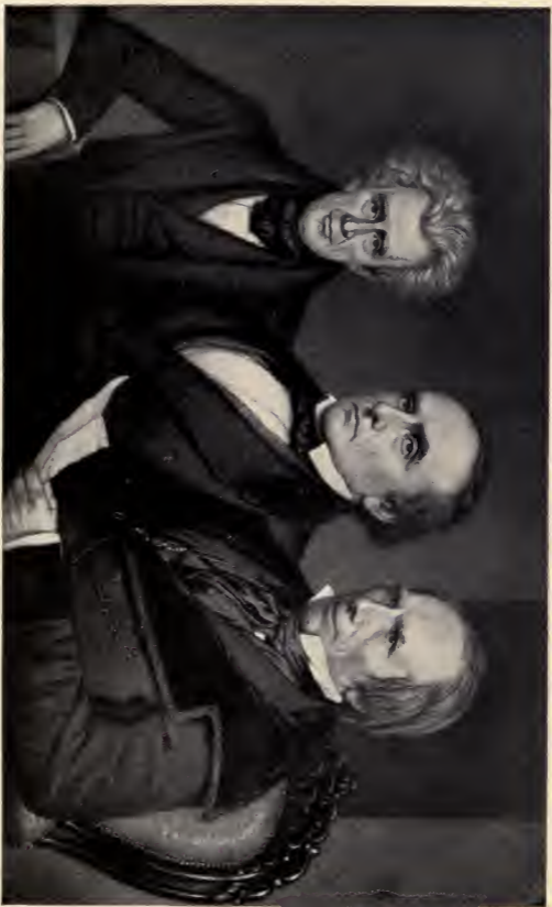
WEBSTER, CLAY, AND JACKSON