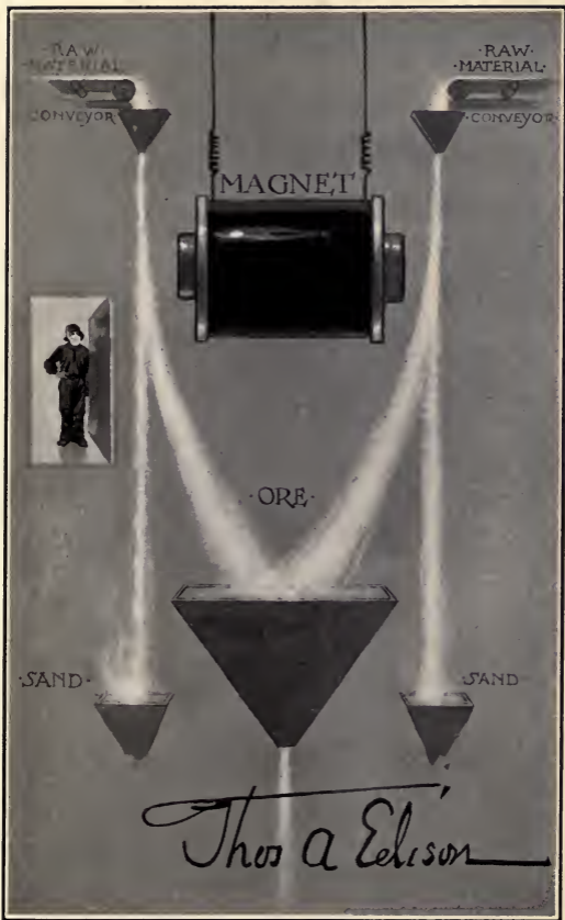
EDISON'S MAGNETIC ORE SEPARATOR (From original sketch by the inventor)