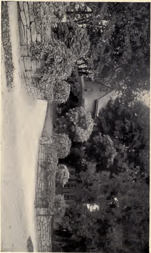
“ROADSIDE,” THE HOME OF LUCRETIA MOTT