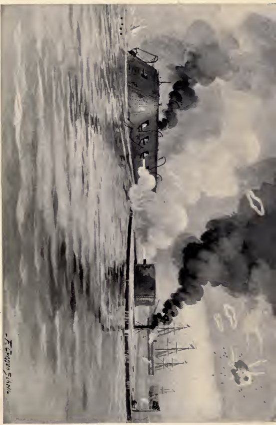
BATTLE OF THE MONITOR AND THE MERRIMAC