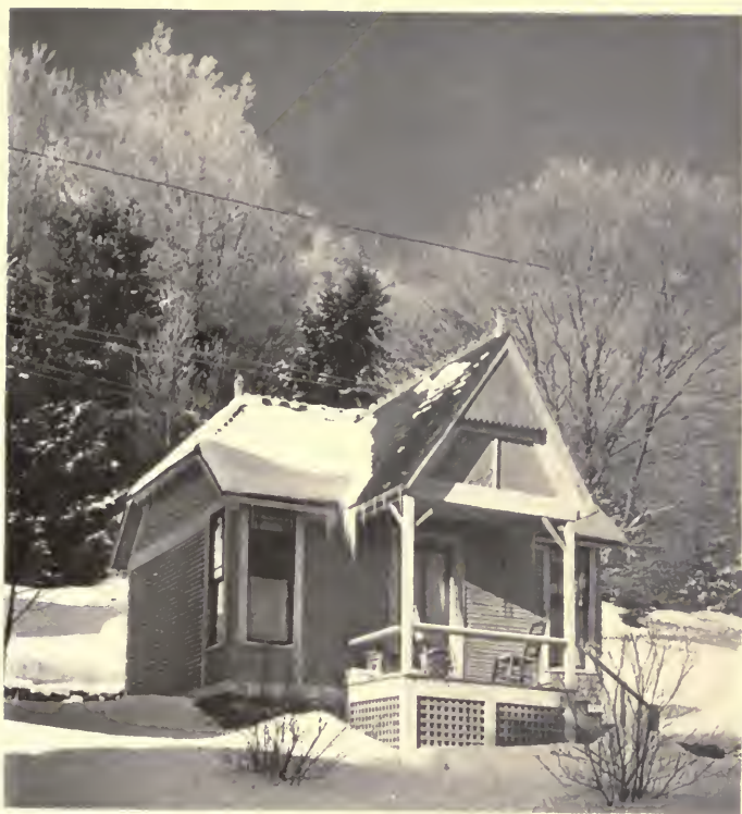
The first of the sanitarium cottages built in 1885; known as "The Little Red"