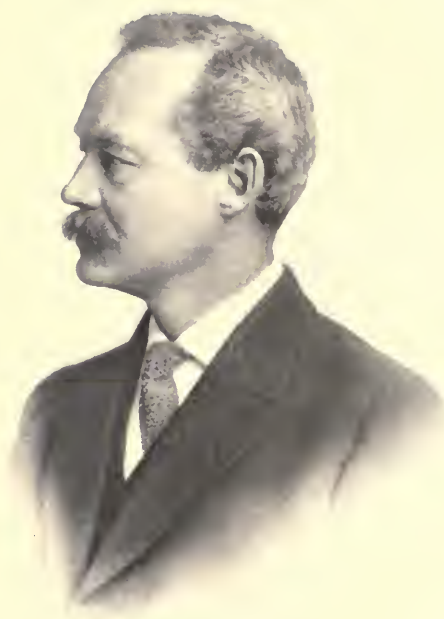
Dr. Wilfred T. Grenfell