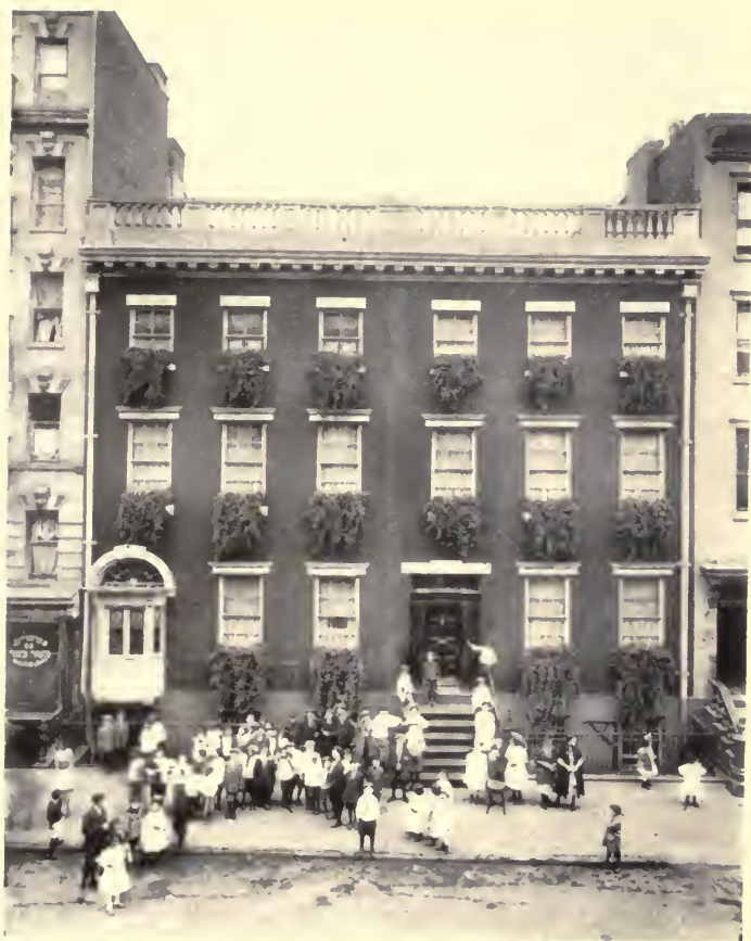
The Jacob A. Riis settlement, Henry Street, New York