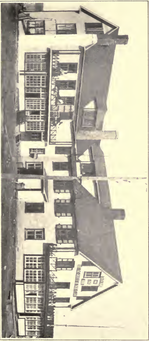
The hospital at St. Anthony, Northern Newfoundland